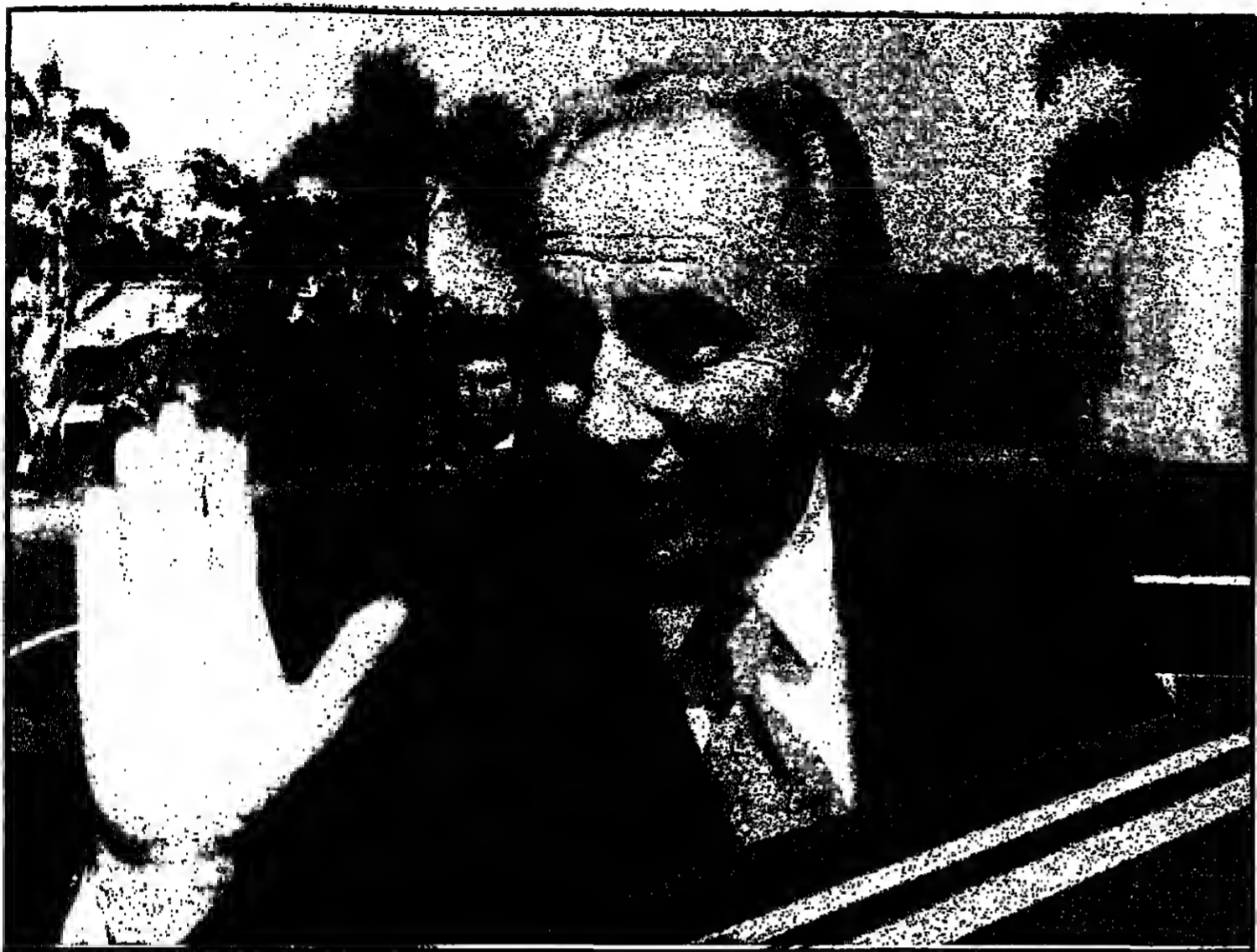
Labor Party leader Shimon Peres waves as he leaves Bangkok's Government House yesterday. Peres told an economic conference that Jewish settlements in the territories are an obstacle to the peace process.